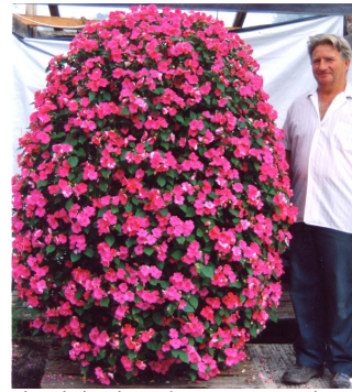
Floral display of Impatiens with Broadleaf P4 in the substrate to ensure efficient supply and use of water to this thirsty species.