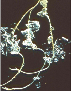
Roots grow right through watercharged Broadleaf P4 gel, to extract over 95% of the stored water, as required.